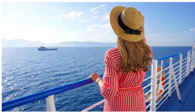
Royal Caribbean Wows Cruisers With Short Beach Cruise Vacations

Royal Caribbean unveils plans for its latest Oasis-class vessel, Utopia of the Seas. The ship will sail year-round on short cruises departing from Port Canaveral, Fla., beginning in the summer of 2024. This is a departure from the company's former approach of introducing